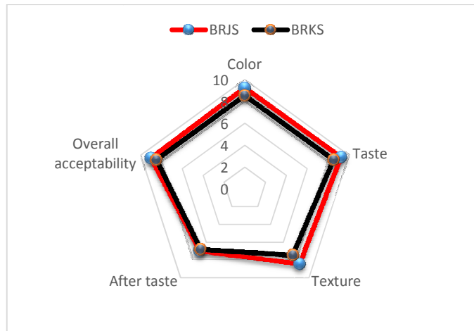
Fig. 3. Sensory evaluation of beet root chips