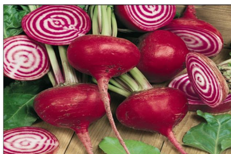
B) Beet slice