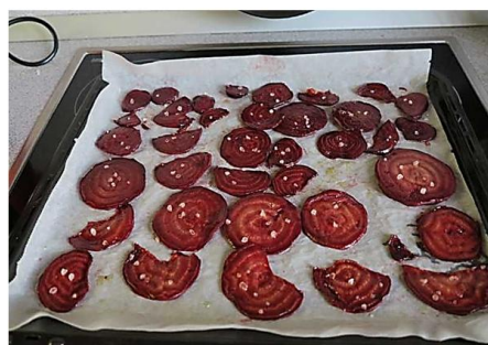
C) Raw slice