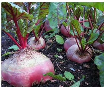
A) Beet root plant

The Beet root and its products help to reduce blood pressure (bp), remove the cancer, and also support detoxification in human body for rapid relaxation. Beetroot contain the all nutrients per 100 g such as, Carbohydrates (9.96 g), Sugars (7.96 g), Dietary fiber (2.0g), Fat (0.18 g), Protein (1.68 g), Vitamin A (2 µg), Vit.B 1 (0.031 mg), Riboflavin (0.027 mg), Niacin (0.331 mg), B5 (0.145 mg), B6 (0.067 mg), Folate (80 µg), Vitamin C (3.6 mg), Ca (16 mg), Fe (0.79 mg), Mg (23 mg), P (38 mg), K (305 mg), Zn (0.35 mg), Na (77 mg) [2].