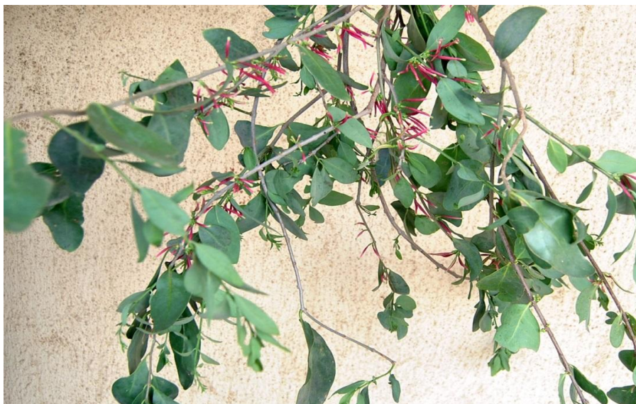
Fig. 1. Photograph of Globimetula braunii plant

The organoleptic property of the extract was carried out.