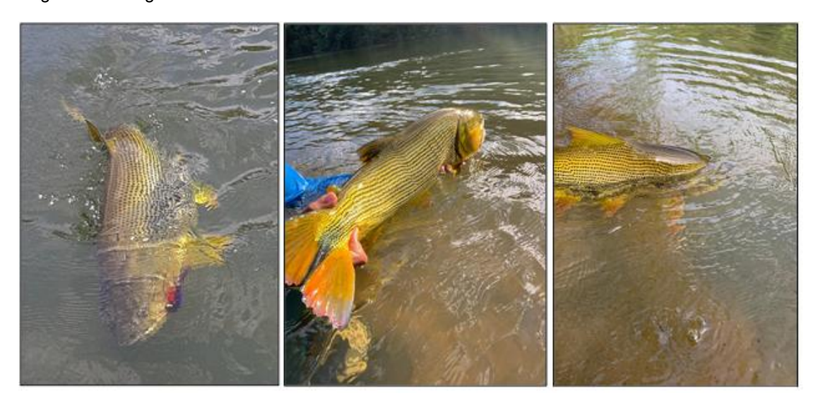
Fig. 3. Images of the capture and release of specimens of Salminus brasiliensis in the locations where the interviews were conducted from 2018 to 2020 in Mato Grosso, Brazil Photographic record of the capture (image on the left), acclimatization of S. brasiliensis on the riverbed (central image) and release of the salmininae specimen back to the river (image on the right).

In order to verify and analyze the sport fishing modality practiced in the rivers of Mato Grosso/Brazil, near the banks of the Manso, Cuiabá and Paraguay rivers, 122 individuals involved in fishing were interviewed, who were available to participate in the research, 37 of which were sport fishermen (30.3%), 22 artisanal fishermen (18.1%) and 63 fishing guides (51.6%). Among the fishing guides (n=63); 52 of them also carried out artisanal fishing (82.5%) and the remaining 11 individuals work only in the activity of guides (17.5%) (Graphic 1).