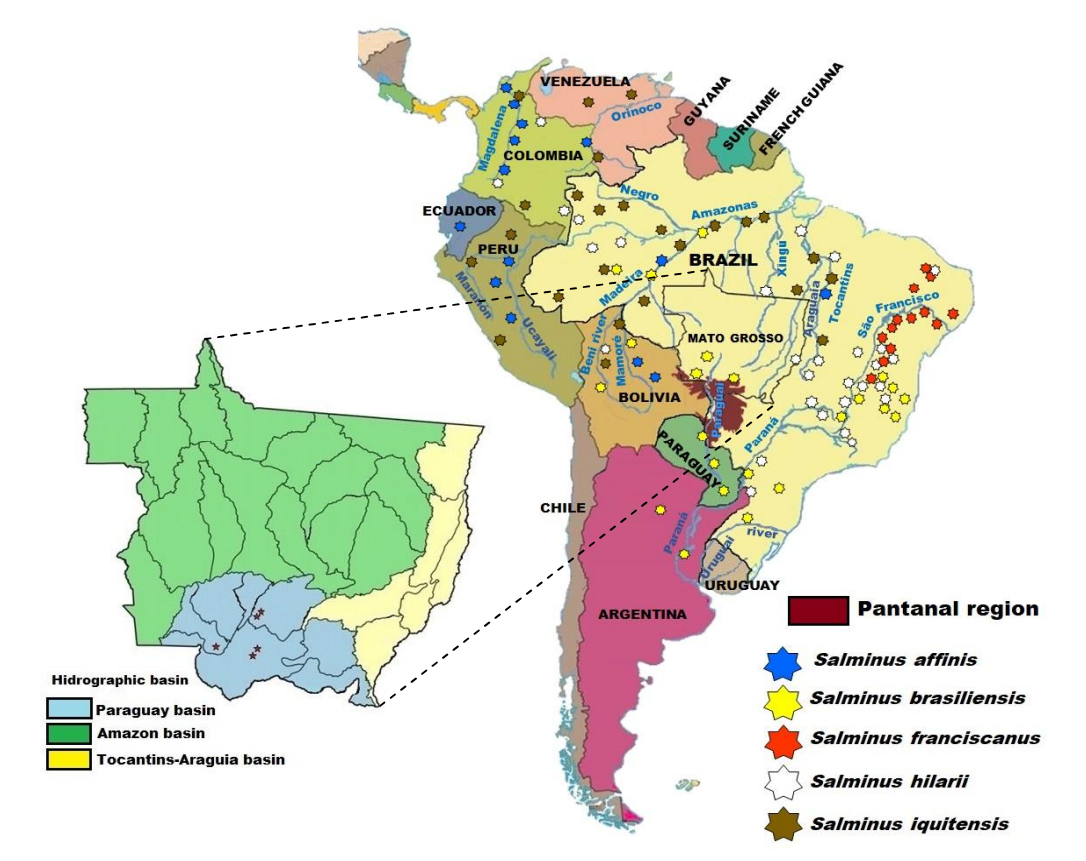
Fig. 2. Representative map of the geographic distribution of the genus Salminus by South America (larger scale) and Map of Mato Grosso, central western region of Brazil (smaller scale) showing the location of the points where the interviews were conducted in the period 2018 to 2020 and their respective hydrographic basin, highlighted in color

The distribution of specimens of the genus Salminus distributed throughout South America can be seen on the map, showing the location of the five species described so far (Fig. 2).