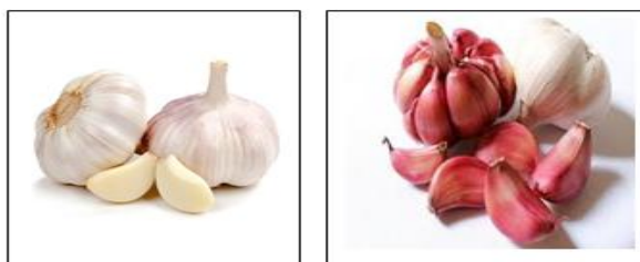
Fig. 2. Allium sativum