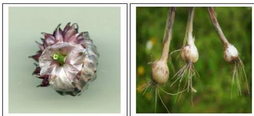
Fig. 5. Allium vineale L.

disulfide (7.9–12.5%), dimethyl trisulfide (4.3–17.4%), diallyl disulfide (4.4–12.2%), diallyl trisulfide (2.8–10.5%), and methyl ( E )-1-propenyl disulfide (2.6–12.5%). The high proportion of sulfur containing components (ranged between 74.9 and 91.6%) [50,51].