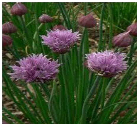
Fig. 3. Allium schoenoprasum L.

Fig. 3 gives an image leaves and flowers of Allium schoenoprasum L