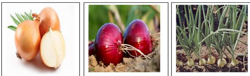
Fig. 1. Allium cepa L

Meanwhile, several disulfide radicals (allyl, methyl, propyl) have been found in red onion varieties by TLC using dichloromethane extraction. Quantitative analysis showed that di- and trisulphides, such as cis- and trans-methyl-1-propenyl disulphide, methyl-2-propenyl disulphide, dipropyl disulphide, cis- and trans-propenyl disulphide, methyl-propyl trisulphide and dipropyl trisulphide, were abundant and accounted for about 60% of the sulphur compounds [17].