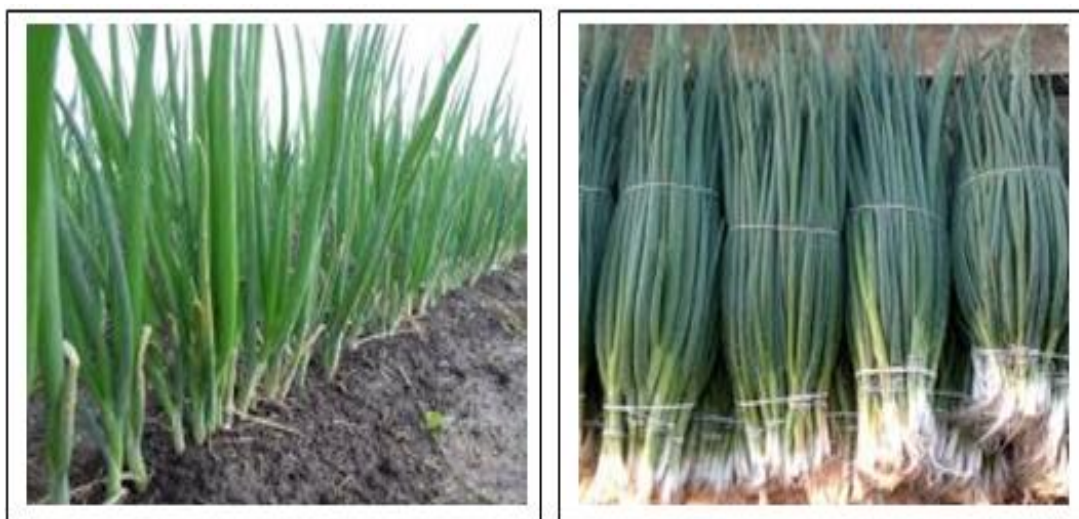
Fig. 4. Allium fistulosum L