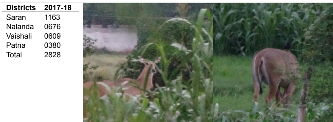
Table 1. Killing of Nilgai in different districts of Bihar [5], due to human animal conflict

Adult male was blue-grey in colour but females were smaller with all adolescents are light in shade and look like a cow details presented in (Table 2, Fig. 2, a, b, d & f). Oguya and Eltringham [21] reported only males possess horns 15-24 cm in length. Leslie, [18] reported a clear cut sexual dimorphism in animals. The males are larger than females and differ in coloration. In the present study it is observed that the Nilgai has reshaped the pattern of grazing, distribution and behavior due to demographic pressure, climate change and decline in food and water resources, increase human population and with development work, the populations of Nilgai were forced to move out of the "ideal zones" into the "small areas" in due course of time this may led to the domestication of this animals.