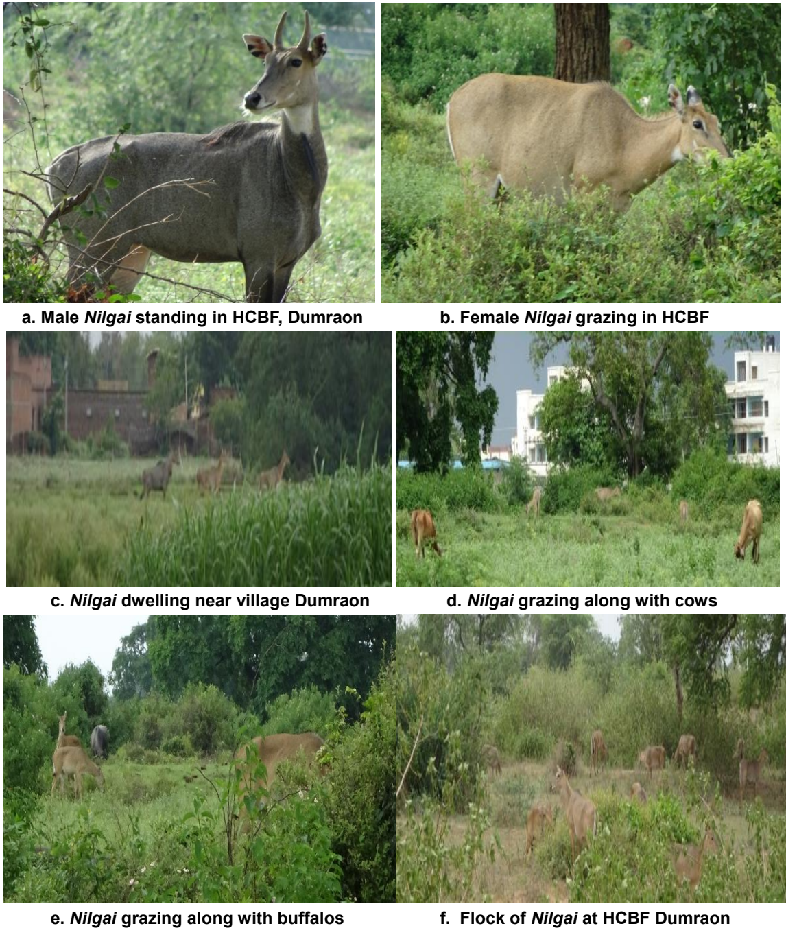
Fig. 2. Boselephus tragocamelus shows docility behavioral activity (a,b,c,d,e,f), in Dumraon