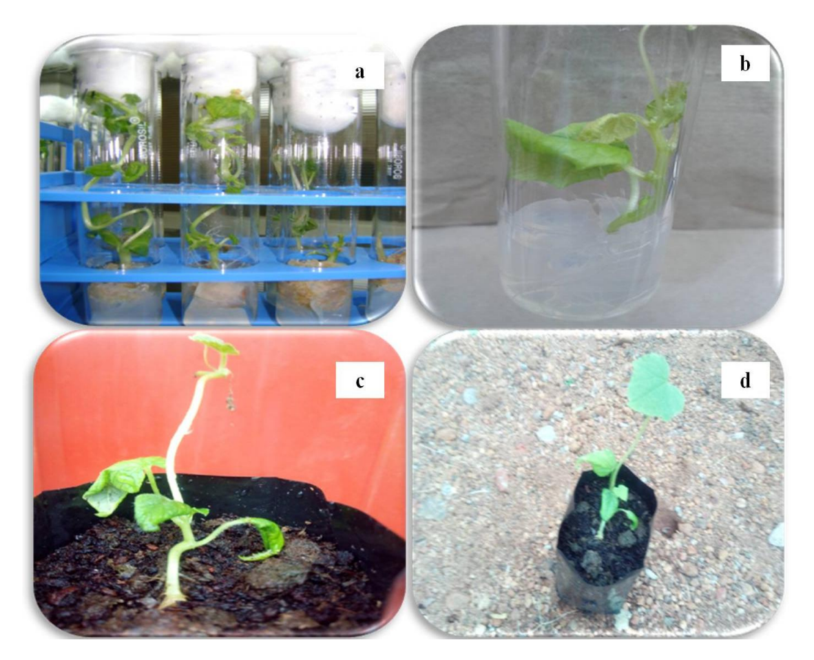
Fig. 1. Stages of in vitro plant regeneration; a: Multiple shoot regenerating; b: Root initiation; c: Regenerated plant; d: Hardened plant

obtained from gynoecious and parthenocarpic genotypes were partially fertile and from monoecious genotypes were fully fertile (Fig. 2). This might have happened due to high concentration of cytokinin hormone used in the media. It had been earlier reported that flowering of cucumber in tissue culture depends on the type of explant, media composition, type of plant growth regulators and their concentration [31]. Production of the single parthenocarpic cucumber fruits by use of an automated culture system administering compressed air earlier has also been reported Tisserat and Galletta [32]. The air circulation for decreasing the ethylene effects might be one of the reason for sex modification. In-vitro male flowering in monoecious cucumber was also reported by various researchers namely Rajasekaran et al. [13], Msikita et al. [14] and Kielkowska and Havey [31].