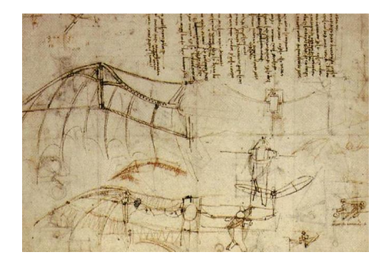
Fig. 1. Leonardo Da Vinci's design for a glider [9]

away from their fields [1,2,3]. Examining the anatomy of birds in order to design an aerial vehicle another is instance of early biomimetics. Well-known scientists. like Leonardo da Vinci, examined the composition of attempted to replicate bird wings and such characteristics. The graphic below displays sample of a piece of Leonardo da а similarity Vinci's drawings. The of the device to a bird's wing is clearly seen [4,5,6,7].