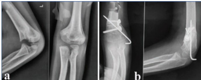
[Table/Fig-6]: (a) Radiograph showing preoperative varus angulation. (b) Postoperative six months radiograph showing complete correction of deformity and union at the osteotomy site.