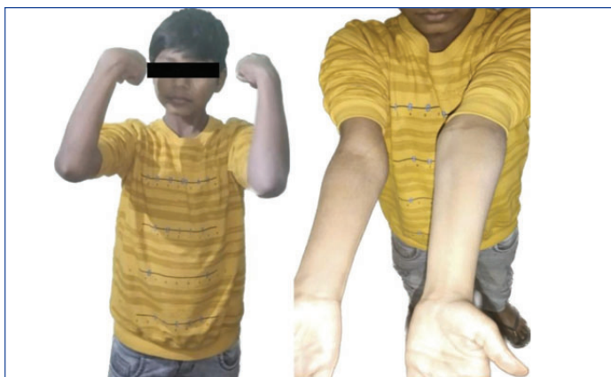
[Table/Fig-7]: Postoperative clinical photograph of near normal carrying angle and full Range Of Motion (ROM).