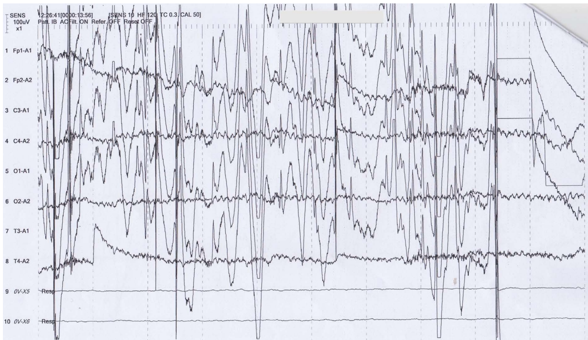
Figure 3. EEG report showing Epileptic activity after cough.

Several studies reported that any aura involved with epilepsy was developed mostly in a mesial temporal epilepsy. A study showed that majority of their patients with a mesial temporal epilepsy developed some sort of somatosensory aura mostly in the form of a tingling sensation in the upper extremities [5]. The study based on abdominal aura showed that development of an abdominal aura was more common in patients with temporal lobe epilepsies compared to those patients with an extra temporal epilepsy. Among the temporal lobe epilepsies