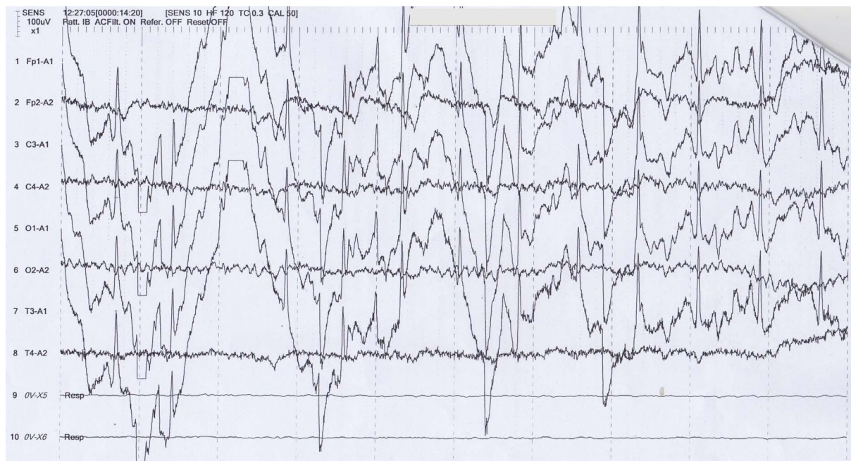
Figure 4. EEG report showing Epileptic activity after cough.

it was also reported that aura was more common in mesial temporal epilepsy than neocortical epilepsy [4]. The study based on olfactory aura reported that their patients MRI scans revealed structural lesions in the mesial temporal structures and two of their patient's scans even revealed structural lesions in the amygdale [3].